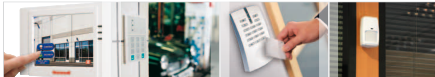
Galaxy® Dimension TouchCenter

Class-leading peripherals: using the latest technologies